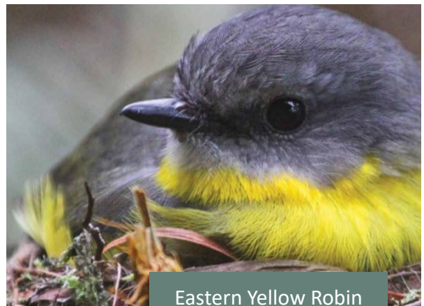
Eastern Yellow Robin