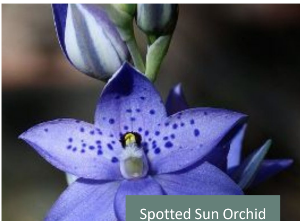
Spotted Sun Orchid

Latrobe Reserve Friends Group meets on the 3rd Saturday of each month (Feb-Nov), working on weed eradication and planting field activities. If you would like to join the team or contribute in any way, please contact our DFCoM secretary on 59810933