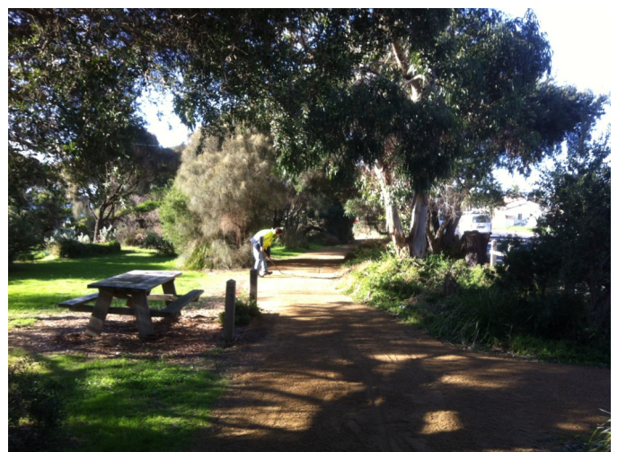
More Bay Trail Works