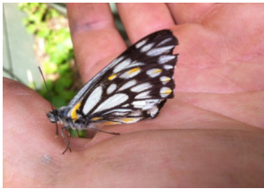
An Example of our magnificent fauna and Flora. A Caper White Butterfly and a Wax Lip orchid are shown here.