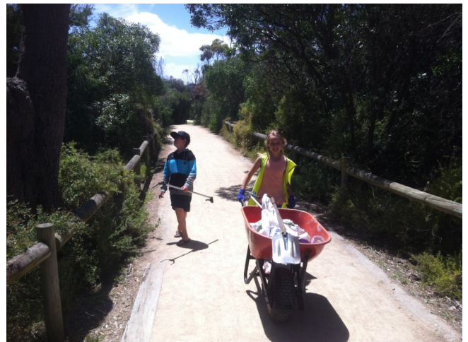
Volunteers helping with the Bay Trail Works