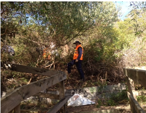
Friends of Latrobe Volunteer Group working alongside Federation Walk helping to remove noxious woody weeds.